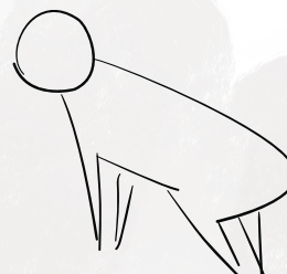
DAD RHINO TWIN