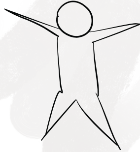
HOLD US NEARER